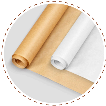
● in roll white and brown