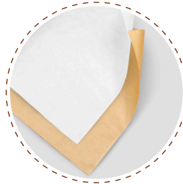
● in sheets white and brown