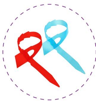
Red or blue 8-tooth safety clip